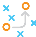
STRATEGY Page 4